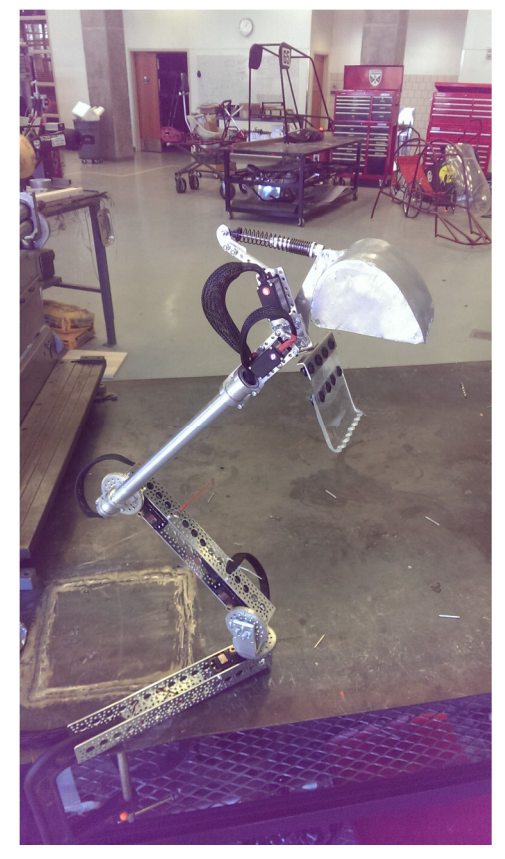
Arm and Claw Setup

The master-slave method of controlling the arm that was proposed in the team's original project plan has been met with great success. The rover's arm, the "slave", is controlled by an identical arm, the "master", at mission control. The master is constructed from the same hardware as the slave but the servos have been removed from their gearboxes. The signals from potentiometers mounted to each joint of the master are passed out to an Mbed microcontroller, which are in turn mapped to signals that are be sent to the rover. The slave arm