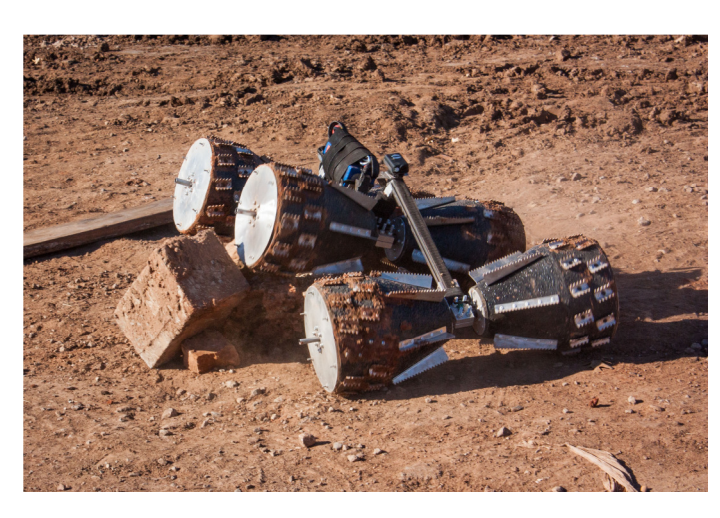
Testing on Obstacles

The rover is well suited for all types of terrain but it performs best in sand and gravel. The large wheel footprint allows the rover to stay above loose surfaces and the large paddles in