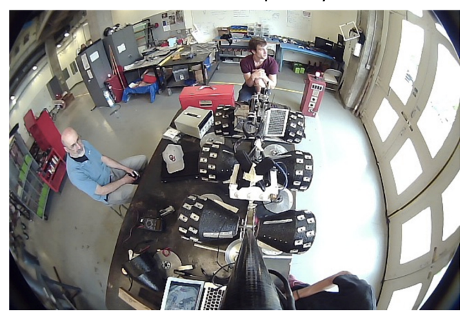
Camera Feed from Downview Camera

Five cameras are attached to the rover. The primary camera is the "drive" camera, which is mounted firmly to the camera mast. This camera, a Point Grey BlackFly, offers manually adjustable zoom and focus and computer adjustable resolution and exposure. The second